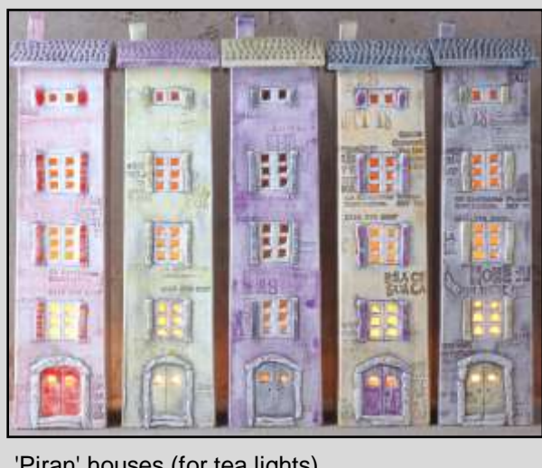
'Piran' houses (for tea lights)