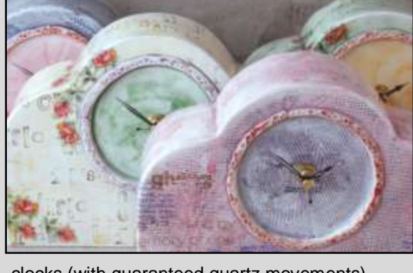
clocks (with guaranteed quartz movements)